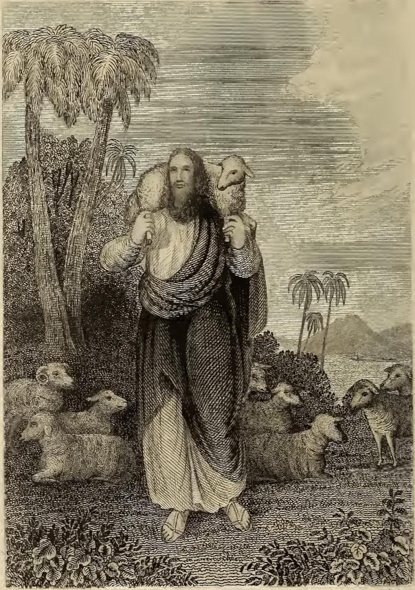
THE GOOD SHEPHERD.